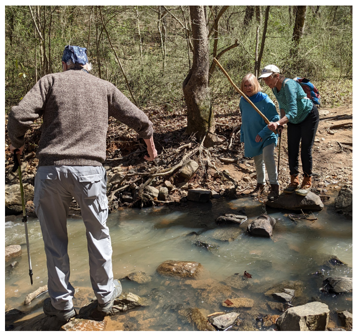
Spring Explore Hike upstream of the Bynum Dam

We began to offer in-person group events this spring. We held three Whack Attack workdays with State Parks staff to continue removal of invasive plants in the Bynum Mill area. We also held three outings around the state natural area. Visit our website www.lowerhaw.org for information and follow us on Facebook and Instagram.