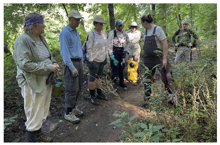
Volunteers and State Parks staff at invasive plant removal workday

Triangle J Council of Governments (TJCOG) is assisting with two projects involving the Haw River corridor. For one of the projects, TJCOG is hiring an Economic Development Specialist position for Alamance and Chatham counties. The person hired for this position