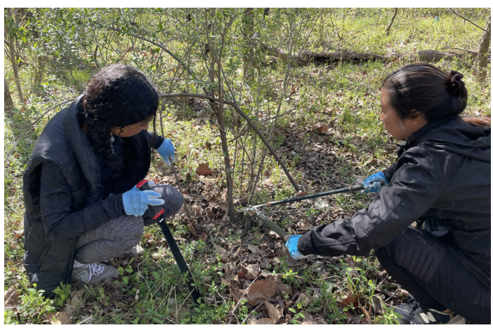
Volunteers at invasive plant removal workday

will utilize a highly regarded, nationally recognized framework known as Trail Towns to aid in the sustainable revitalization of trail towns positioned along the Haw River corridor. This position is funded by a grant award from the U.S. Department of Commerce Economic Development Administration (EDA). Under a 20-month contract, the Economic Development Specialist will provide technical assistance throughout the Haw River region to augment opportunities in the retail, accommodation, food and beverage, tourism, outdoor recreation, and entertainment sectors to help them recover from the COVID pandemic. The position will have an office in Graham (Alamance County), Pittsboro (Chatham County), and Durham, (Triangle J Council of Governments). For the other project, TJCOG will be issuing a Request for Qualifications (RFQ) for consulting services to work on Chatham County's Haw River trail corridor feasibility study/economic impact analysis project. This project is also funded by the same EDA grant award that is funding the