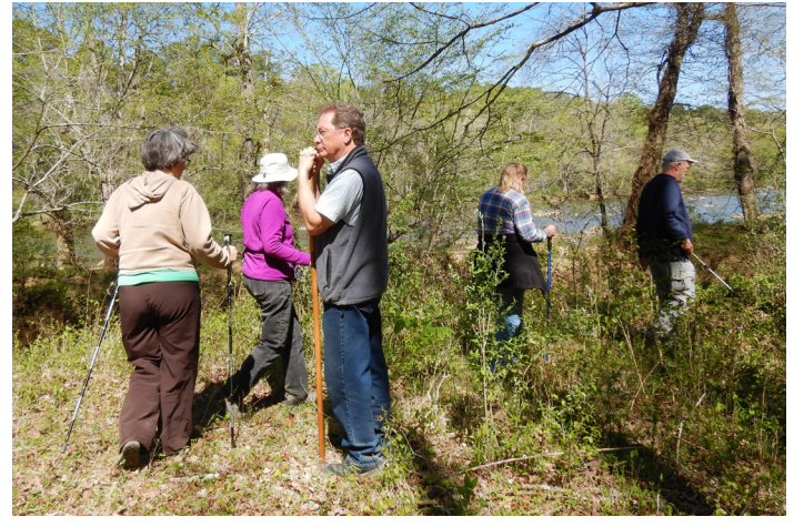
Upland Explore Hike at US 64

will utilize a highly regarded, nationally recognized framework known as Trail Towns to aid in the sustainable revitalization of trail towns positioned along the Haw River corridor. This position is funded by a grant award from the U.S. Department of Commerce Economic Development Administration (EDA). Under a 20-month contract, the Economic Development Specialist will provide technical assistance throughout the Haw River region to augment opportunities in the retail, accommodation, food and beverage, tourism, outdoor recreation, and entertainment sectors to help them recover from the COVID pandemic. The position will have an office in Graham (Alamance County), Pittsboro (Chatham County), and Durham, (Triangle J Council of Governments). For the other project, TJCOG will be issuing a Request for Qualifications (RFQ) for consulting services to work on Chatham County's Haw River trail corridor feasibility study/economic impact analysis project. This project is also funded by the same EDA grant award that is funding the