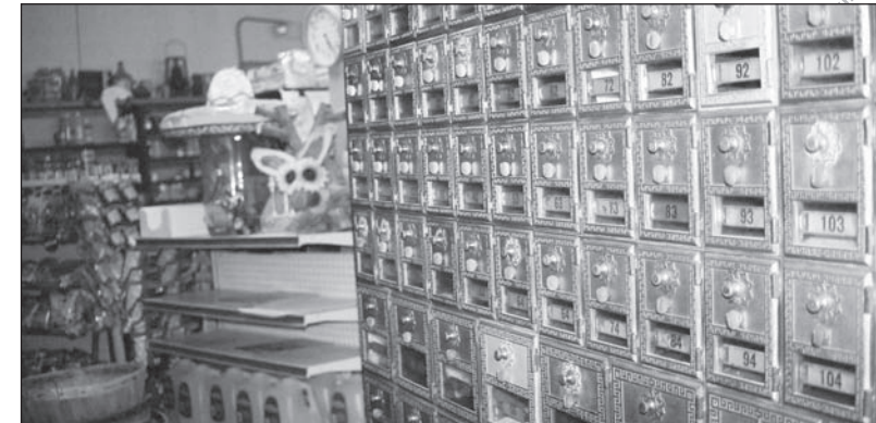
Don't let our new mail boxes disappear like the post office...