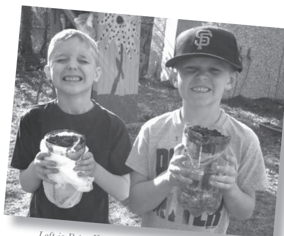
ndig and right is

L this Spring as we continue our mission of making wholesome foods available to residents of the greater Bynum area, contributing fresh produce to those in need through local food pantries, and providing educational opportunities related to growing nutritious foods organically. Several eager gardeners have already planted spring vegetables, and we hope to set another record in 2013 for donations of fresh produce to CORA and other food outlets. We are especially pleased that members of Daisy Troop 1006 are participating again this year by growing birdhouse gourds and tomatoes, and that the local Cub Scout troop, the Tigers from Pack 951, are participating for the first time this year. The Tigers have already planted peas, beets, and radishes. It is gratifying to know that these young people are learning about gardening and nutrition through hands-on experience and that the garden is being used for this purpose.