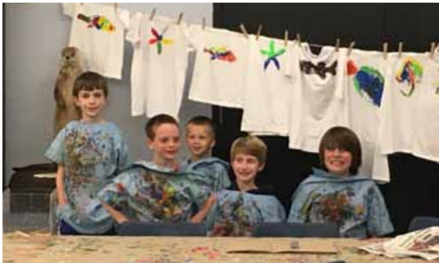
Sleep With the Fishes @ NC Aquarium - fossil print t-shirts