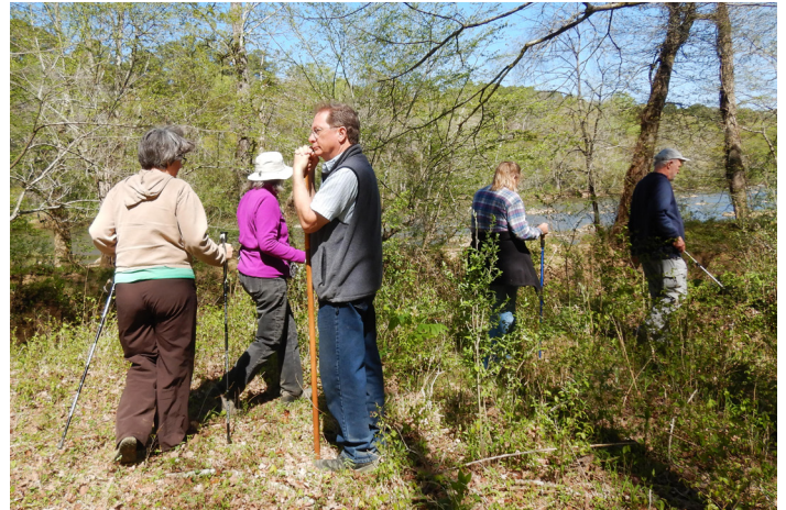
Upland Explore Hike at US 64