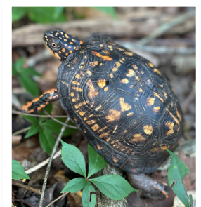
A four legged neighbor