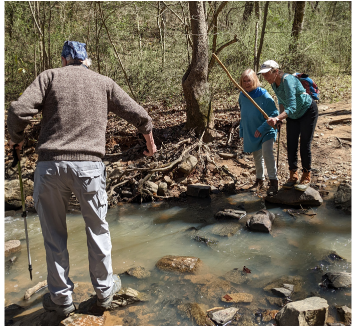
Spring Explore Hike upstream of the Bynum Dam

We began to offer in-person group events this spring. We held three Whack Attack workdays with State Parks staff to continue removal of invasive plants in the Bynum Mill area. We also held three outings around the state natural area. Visit our website www.lowerhaw.org for information and follow us on Facebook and Instagram.