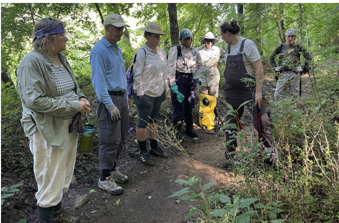
Volunteers and State Parks staff at invasive plant removal workday

will utilize a highly regarded, nationally recognized framework known as Trail Towns to aid in the sustainable revitalization of trail towns positioned along the Haw River corridor. This position is funded by a grant award from the U.S. Department of Commerce Economic Development Administration (EDA). Under a 20-month contract, the Economic Development Specialist will provide technical assistance throughout the Haw River region to augment opportunities in the retail, accommodation, food and beverage, tourism, outdoor recreation, and entertainment sectors to help them recover from the COVID pandemic. The position will have an office in Graham (Alamance County), Pittsboro (Chatham County), and Durham, (Triangle J Council of Governments). For the other project, TJCOG will be issuing a Request for Qualifications (RFQ) for consulting services to work on Chatham County's Haw River trail corridor feasibility study/economic impact analysis project. This project is also funded by the same EDA grant award that is funding the