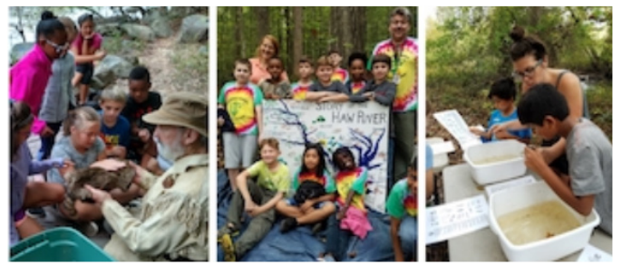
Haw River Learning Celebration

It's Haw River Assembly's 40th Anniversary this year, and we welcome you to join us in the work we do to protect and restore this beautiful river we love. Since 1982, we have worked to