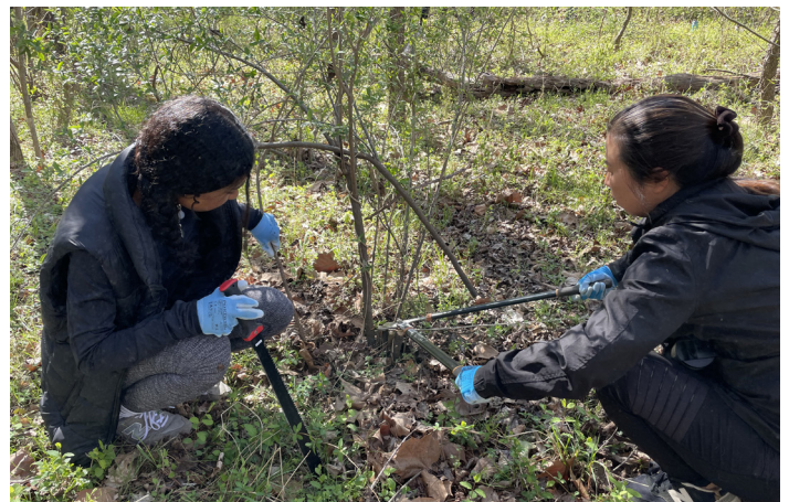
Volunteers at invasive plant removal workday