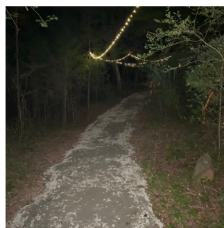
Trail to the ballfield with LIGHTS