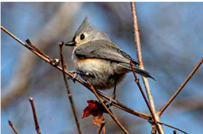
Titmouse at the Haw River