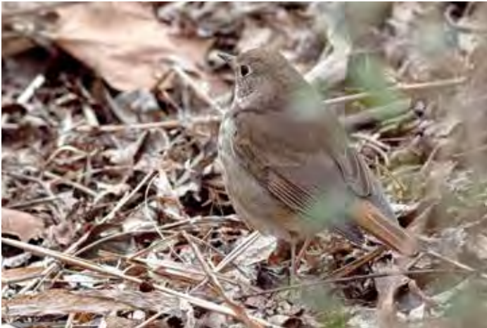
Thrush at the Haw River