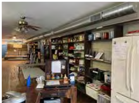
Installed BFP HVAC