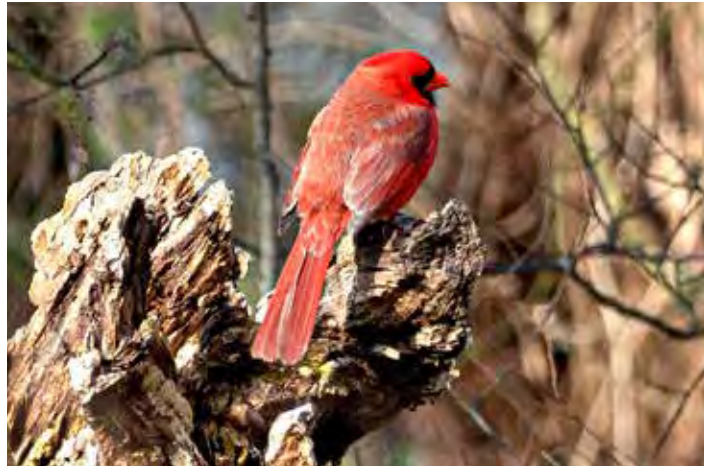
Northern Cardinal at the Haw River

Friends of Lower Haw is focusing this spring on advocating for Chatham County to spend American Rescue Plan Act (ARPA) funds on Haw River corridor projects. Chatham County is receiving more than $14 million in ARPA funds from the federal government to address needs specifically related to the COVID-19 pandemic. Eligible uses for ARPA funds are intended to address public health concerns, negative economic impacts, public sector capacity, and infrastructure needs in response to the pandemic. Advocates spoke at community engagement sessions and county commissioner meetings in support of spending ARPA funds on the Haw River corridor for land conservation, sustainable land and paddle trails, two infrastructure projects in the Lower Haw River State Natural Area, and an Open Space & Trails Coordinator. Other advocacy for the Lower Haw this year includes the Great Trails State Coalition (GTSC). The coalition is a broad-based group of diverse organizations, agencies and supporters advocating for increased state investment in all types of trails statewide.