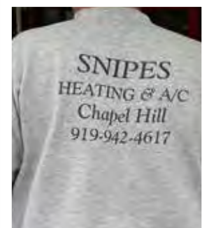
Left – Tommy Snipes T-shirt

Cold... unless you're baking beside the age-old furnace? Winter inside the Bynum Front Porch. NO MORE !!!