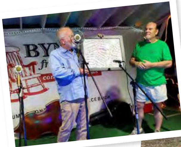
Bluegrass Experience set list presentation