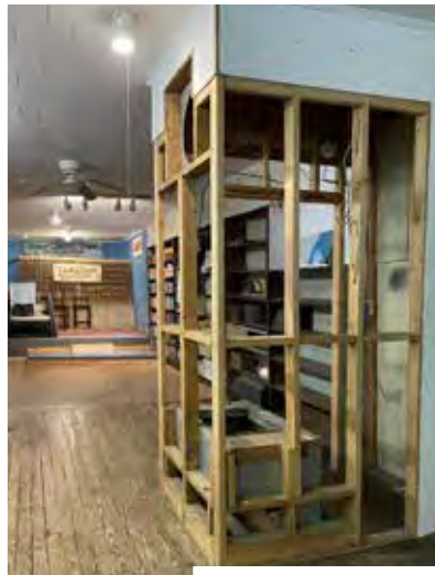
Above – Dismantling of old heater closet in middle of building