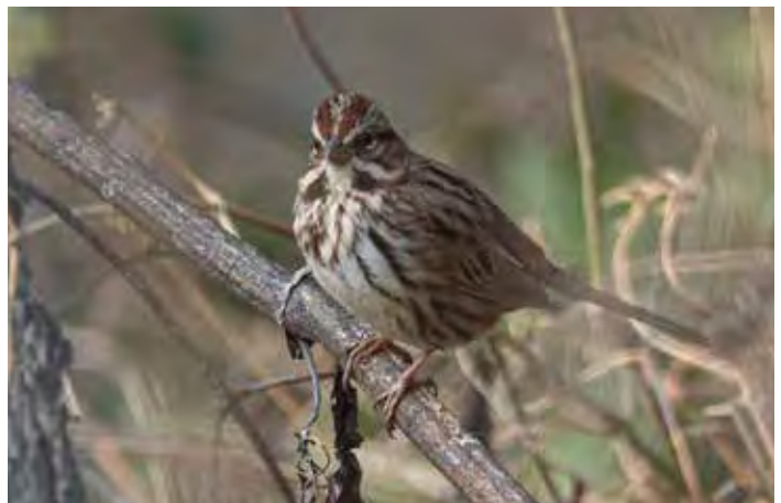
Sparrow at the Haw River