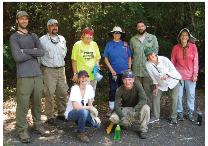
Volunteers in our first Whack-Attack workday