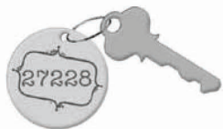
Bynum Post Office Boxes