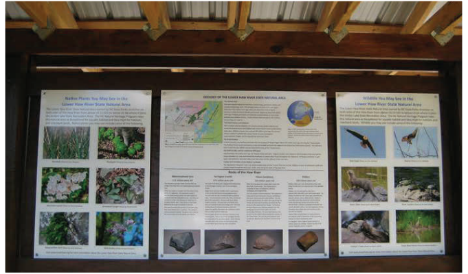
New kiosk signs

page. Both the birdhouse project and wildlife cams were funded by a generous donation from the "be PhilARThropy" Bynum Bridge Fest.