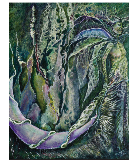
Dragging the Moon behind her Acrylic, torn paper, and modeling paste on canvas. Spring 2015.

Throughout the year, the BFP Pickers meet every 2nd & 4th Saturdays from 10am to about 12-1pm, and all levels of expertise are invited to join them for their jam sessions. Join in with your instrument and voice, or just come listen. Please make plans to attend the Sept. 4 fundraiser and give our Pickers support for their efforts to add to the Grant awards.